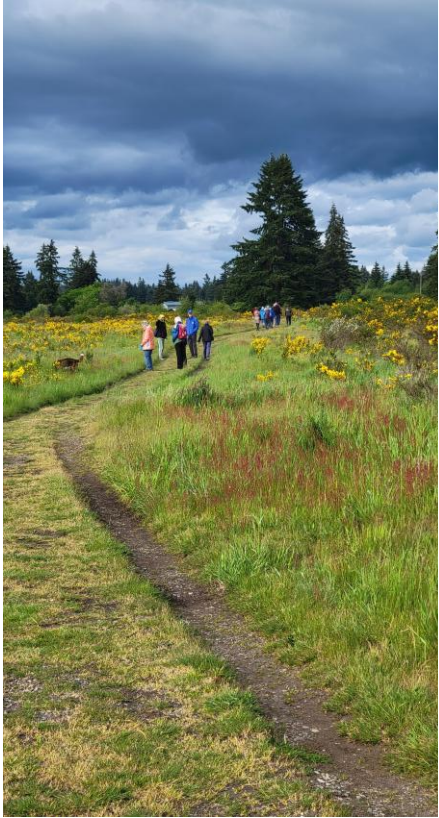
Scatter Creek WA 05/19/26