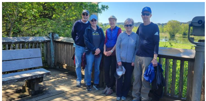
Wild & Woodsy-Nisqually Wildlife Refuge 04/26/26