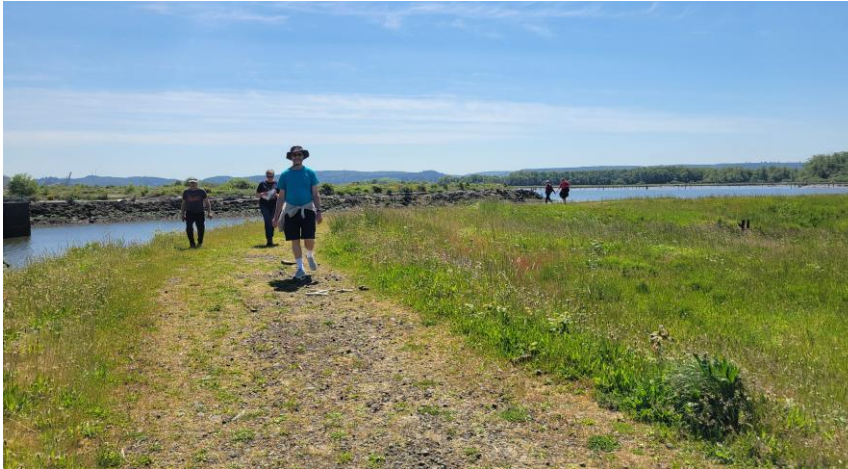
Hoquiam Walk 05/21/26