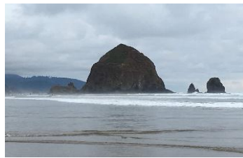
Columbia River Maritime Museum