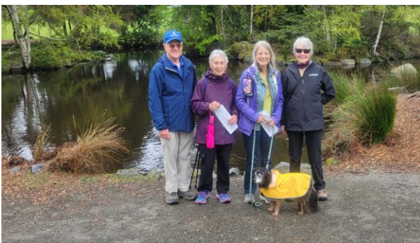
Tacoma vs Ruston-Pt Defiance Park 4/11/26