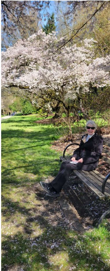
Easter Walk 04/04/26