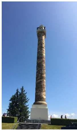
The Astoria Column