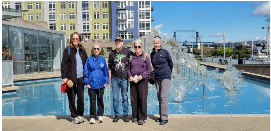
Tacoma Downtown 04/16/26