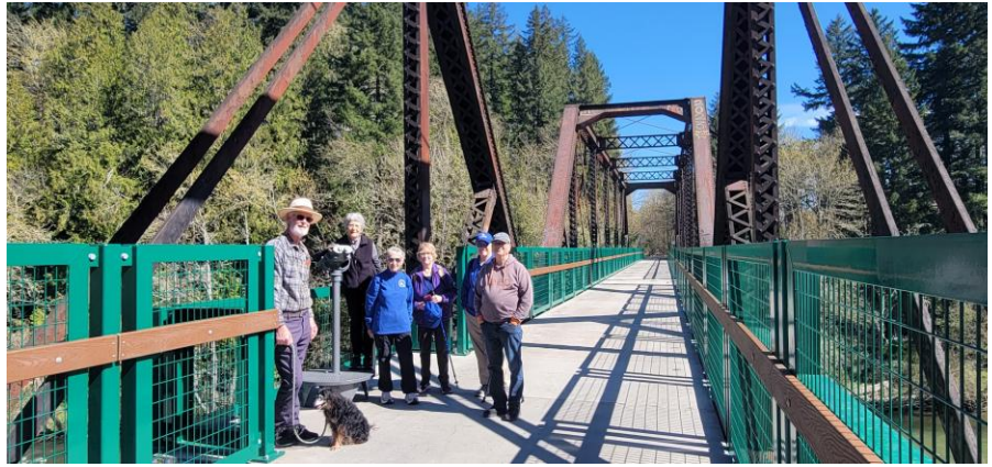
Prairie Line Trail, Yelm 04/09/26