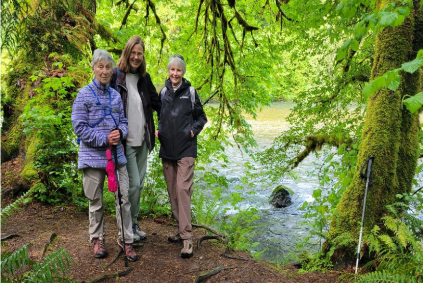
Flaming Geyser State Park 05/16/26